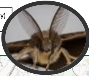
Spongy (Gypsy) Moth