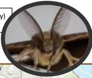
Spongy (Gypsy) Moth