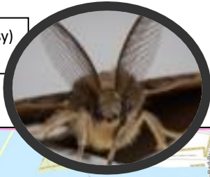
Spongy (Gypsy) Moth